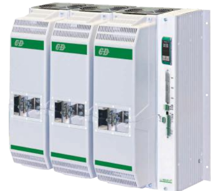
SR23 H 730 x W 717 x D 347 - 98kg.