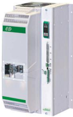
SR21 H 730 x W 329 x D 347 - 34kg.