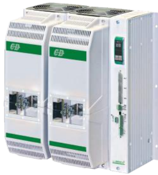
SR19 H 550 x W 523 x D 347 - 49kg.