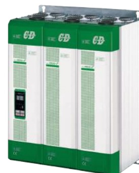
S17 H 560 x W 411 x D 270 - 51,6kg.