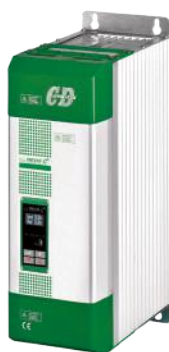
S11 H 440 x W 137 x D 270 - 10,5kg.