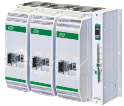
SR20 H 550 x W 717 x D 347 - 72kg.