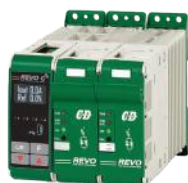
SR10 H 121 x W 108 x D 185 - 1,76kg.