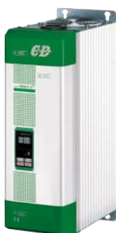
S15 H 560 x W 137 x D 270 - 17,2kg.