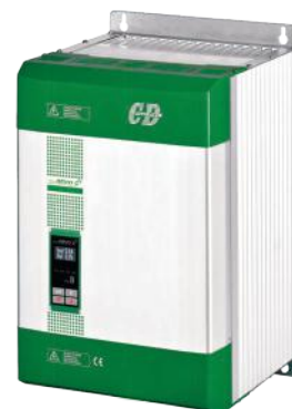
S13/S14 H 440/520 x W 262 x D 270 - 18/22kg.