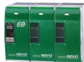
SR14 H 269 x W 279 x D 170 - 10,2kg.