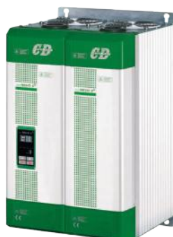
S16 H 560 x W 275 x D 270 - 34,4kg.