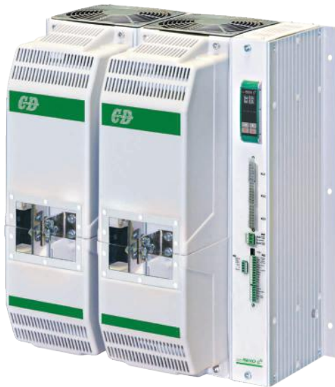
View with IP20 protection