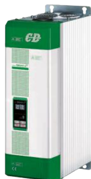
S12 H 520 x W 137 x D 270 - 15kg.