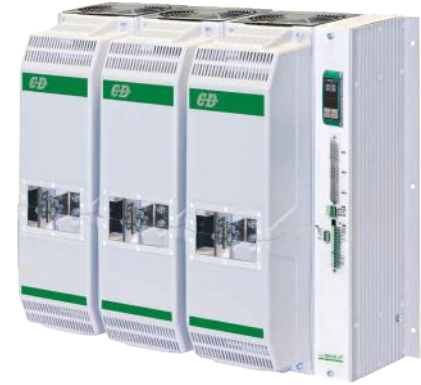
SR23 H 730 x W 717 x D 347 - 98kg.