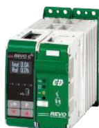
SR9 H 121 x W 72 x D 185 - 1,15kg.

When you buy REVO-C, you also buy CD Automation's experience and know-how to drive your application.