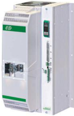
SR21 H 730 x W 329 x D 347 - 34kg.