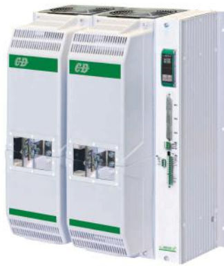
SR22 H 730 x W 523 x D 347 - 65kg.