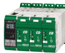
SR11 H 121 x W 144 x D 185 - 2,4kg.