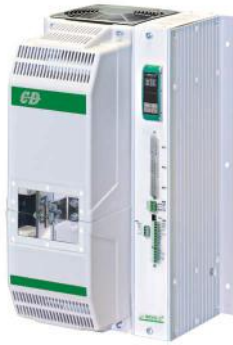
SR18 H 550 x W 329 x D 347 - 27kg.