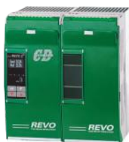
SR13 H 269 x W 186 x D 170 - 6,8kg.